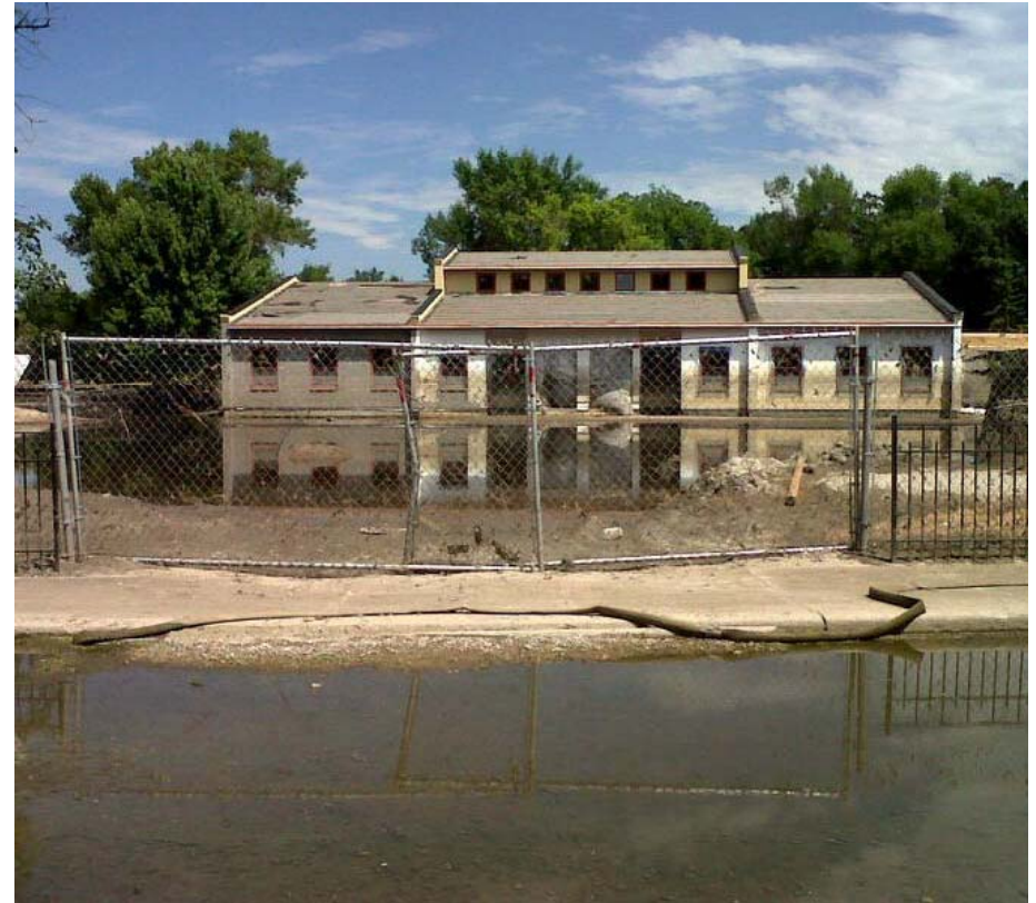
“New” Administration Bldg, Roosevelt Zoo