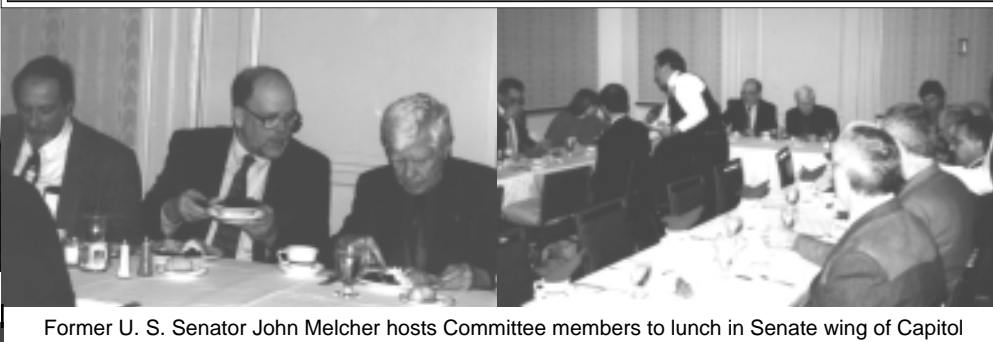
Former U. S. Senator John Melcher hosts Committee members to lunch in Senate wing of Capitol