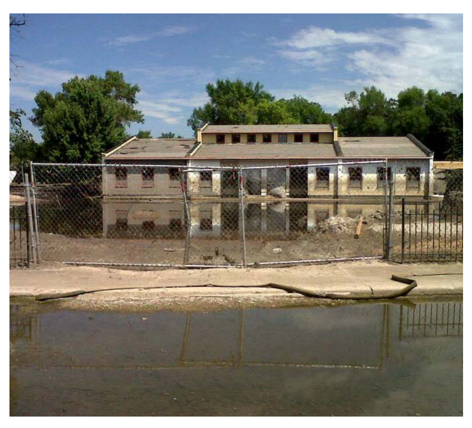
"New" Administration Bldg, Roosevelt Zoo