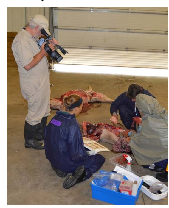
VS District 3 FADD Swine/One Health Exercise August 27, 2014